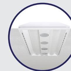
Recessed Mount (Lay-In Fixture T-Bar Grid)