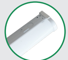
Plastic End Caps