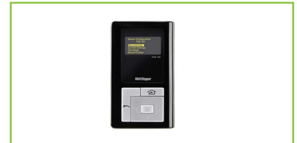
Sensor Remote (FSIR-100)