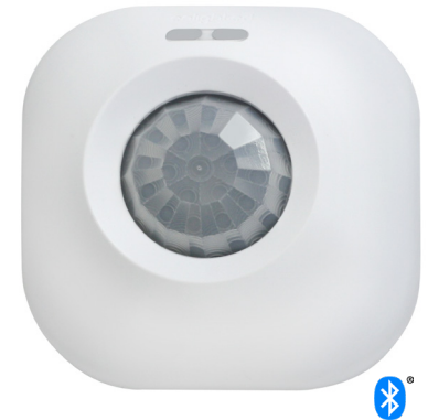
High Bay Sensor, 8-pin

Driver Compatibility: Dimming and on/off control signaling for standard 0-10V ballasts and drivers using linear dimming curve for in LED and fluorescent light fixtures.