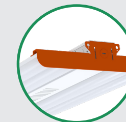
Orange End Cap

Available in lumen packages from 9,000 to 24,000 lumens in 2 ft and up to 46,000 lumens in 4 ft. 120v-277v, 347v, 480v *LED rated life based on HHSL1D1UNVFD840 L70 @ 25C ambient vs. Orion's TLEDB5 retrofit LED tubes.